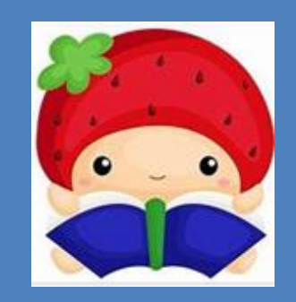
5-minute stories – ideal for bedtime!

Art hub for kids – online drawing tutorials