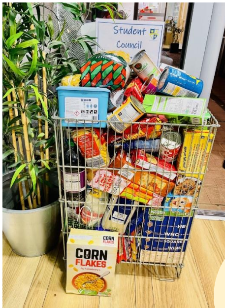
NOW YOU SEE IT